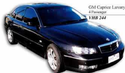
GM Caprice Luxury Sedan 4 Passenger VHB 244