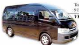
Toyota LIMO Van 9 Passenger VHA 405