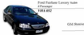
Ford Fairlane Luxury Sedan 4 Passenger VHA 052