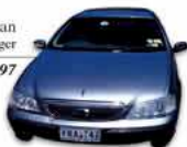
GM Statesman Luxury Sedan 4 Passenger VHA 997