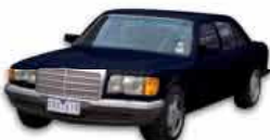
Mercedes 380SEL Classic LIMO 4 Passenger UTP 274