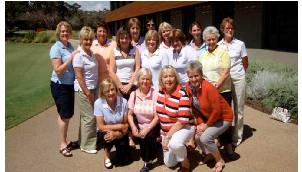
Photo of the ladies who attended Play & Stay at Peninsula in November 2009. Lots of fun, laughter and golf was had by all.