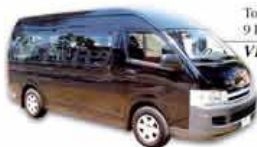
Toyota LIMO Van 9 Passenger VHA 405