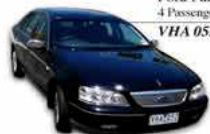
Ford Fairlane Luxury Sedan 4 Passenger VHA 052