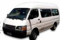
Toyota Hi Ace Mini Bus 12 Passenger